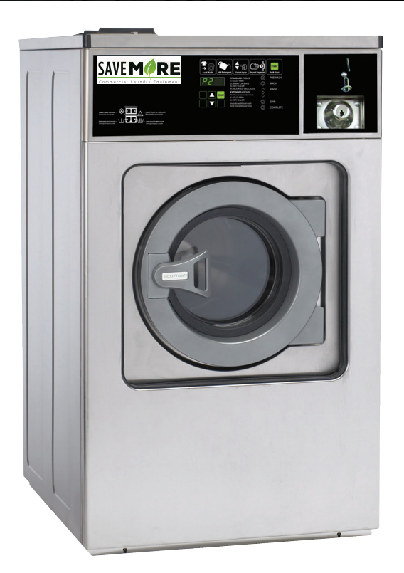
EWR-30 Coin Washer/Extractor