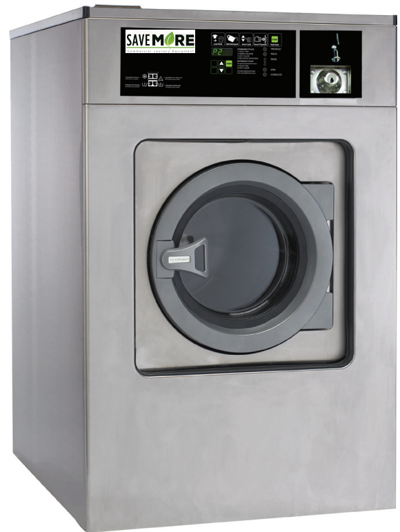
EWH-60 Coin Washer/Extractor