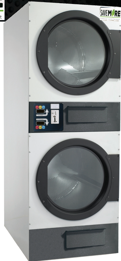
AD-333 Coin Stack Dryer