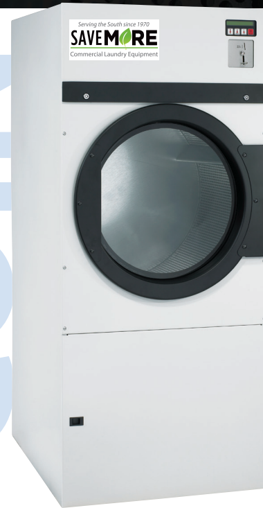
AD-24 Coin Dryer